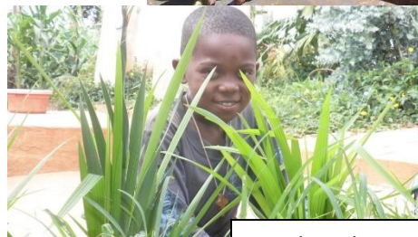
Tending the crops