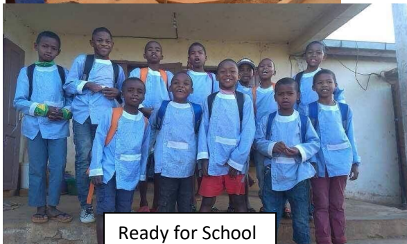
Ready for School