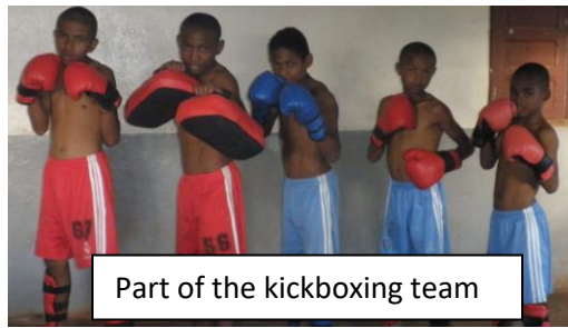
Part of the kickboxing team