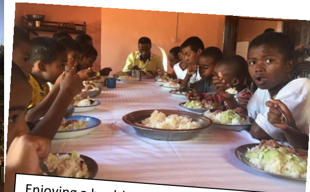
Enjoying a health meal from our own garden