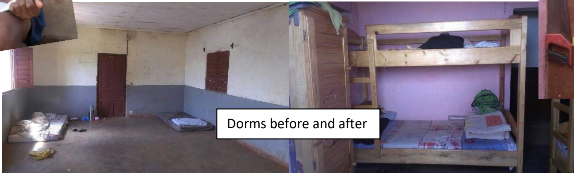
Dorms before and after