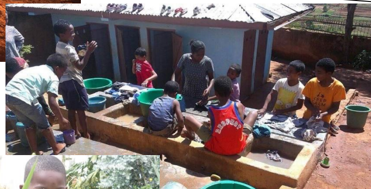
washing clothes with rain water