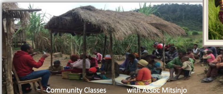
Community Classes with Assoc Mitsinjo