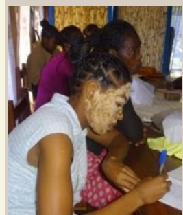
Livelihoods in Melaky