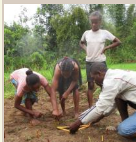
Training in Betampona

Local projects vary according to community needs. Core activities focus on training & equipment for climate-smart agriculture, support with sustainable income-generation, environmental education and reforestation. Activities to support Health and WASH need to be added to the new programme to complete MfM's integrated approach to building Resilience.